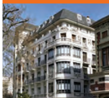
Our school in Zaragoza.

There is a two year language requirement for SYA Spain. To learn more about SYA and to start your application, visit www.sya.org/spain .