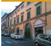
Our school in Viterbo.

SYA Italy is open to beginners as well as students who have some knowledge of Italian. To learn more about SYA and to start your application, visit www.sya.org/italy .