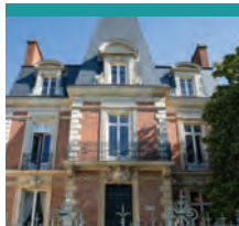
Our school in Rennes.